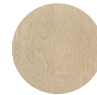
Natural Birch Plywood

High strength and durability. Lightweight, rigid, and resistant to splitting and warping. Easily moldable into curved or irregular shapes. Exterior WBP bonding in accordance with EN 314-2 / Class 3 for outdoor applications. Fire classification: D-s2, d0 (EN 13501), for floors starting from 9 mm. E17 118R11 for buses. Approval for vehicle floors 95/28/EC. Density: 700 kg/m3. FSC and PEFC Certified